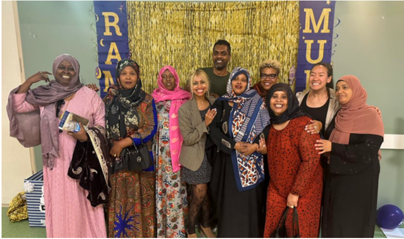
Staff and guests pose for photo at Midaynta's Iftar Gathering