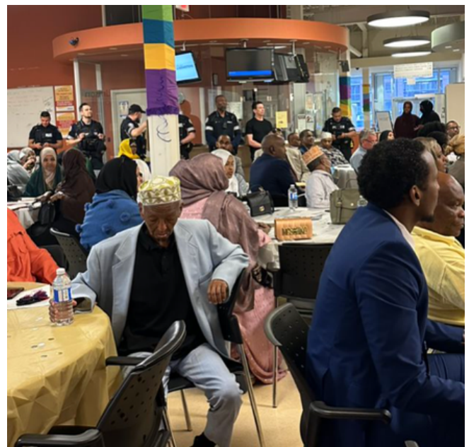
Cross section of the audience at Midaynta's Iftar Gathering